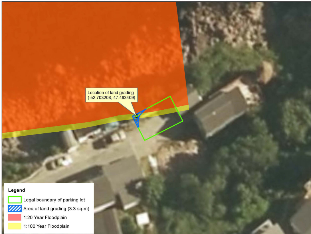
Land grading of parking lot at 96 Southside Road, Petty Harbour