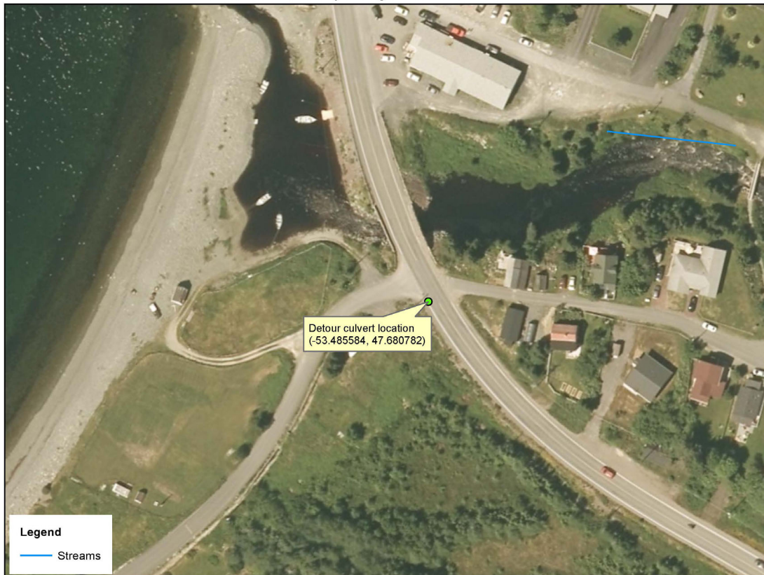
Location of Whiteway Bridge Detour Culvert - Route 80