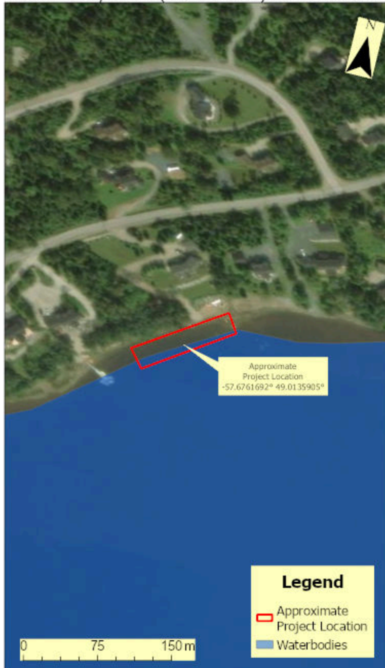
Humber Valley Resort (Humber River) - Debris Removal