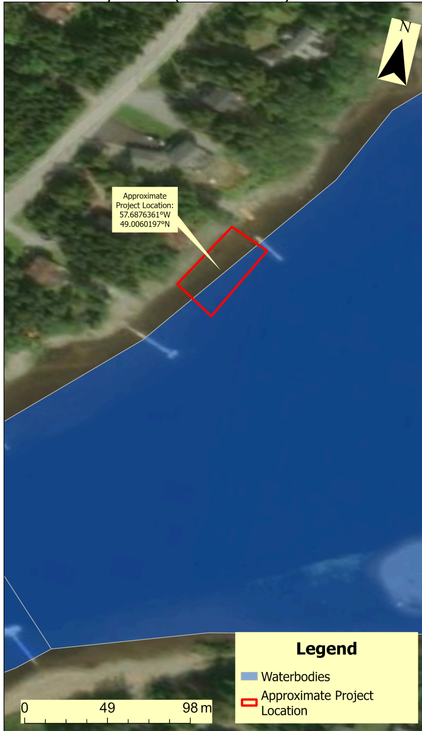
Humber Valley Resort (Humber River) - Debris Removal