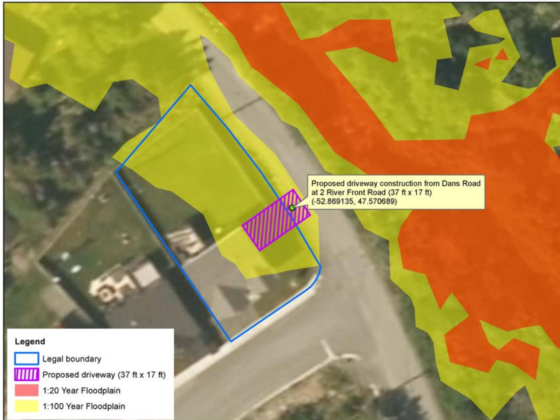
Driveway construction at 2 River Front Drive, Portugal Cove-St. Philip's