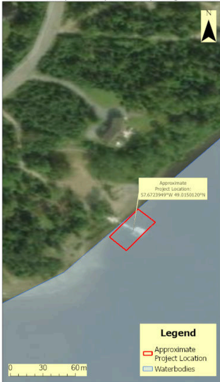
Humber Valley Resort (Deer Lake) - Log Removal