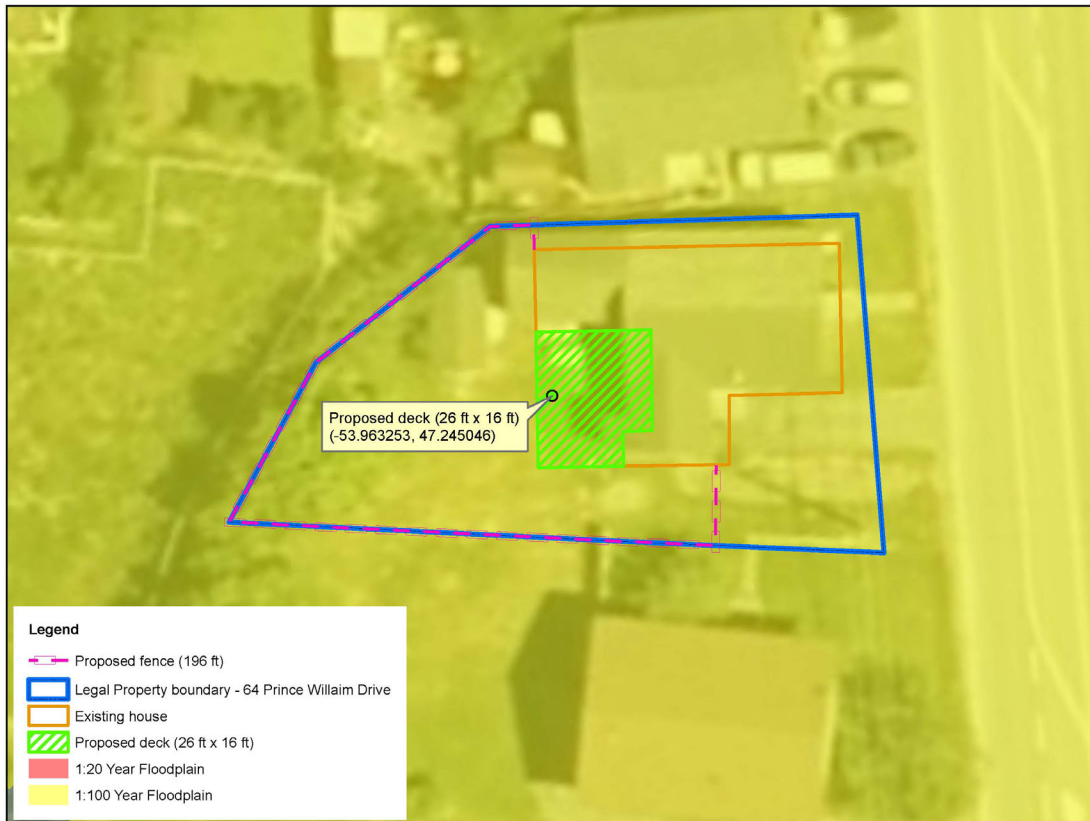
Deck and Fence Construction at 64 Prince William Drive, Placentia