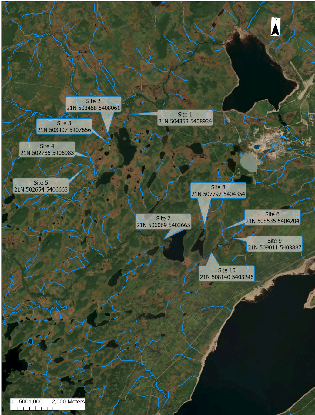
Canterra Minerals Corp - Town of Buchans - Unnamed Tributaries of Harry's River - Fording