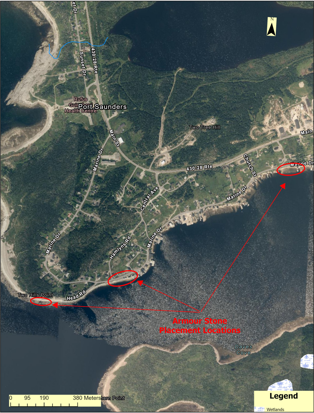
Town of Port Saunders (Port Saunders Bay) - Coastal Erosion Protection