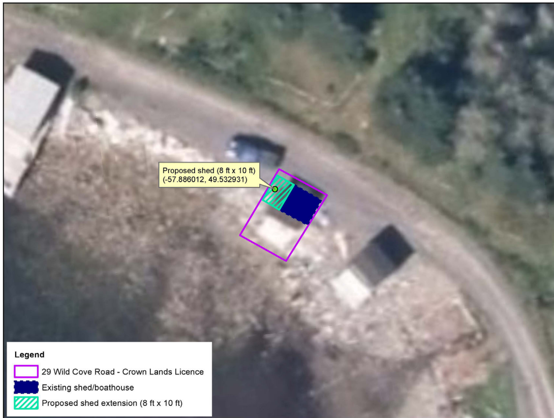
Shed extension at 29 Wild Cove Road in Norris Point