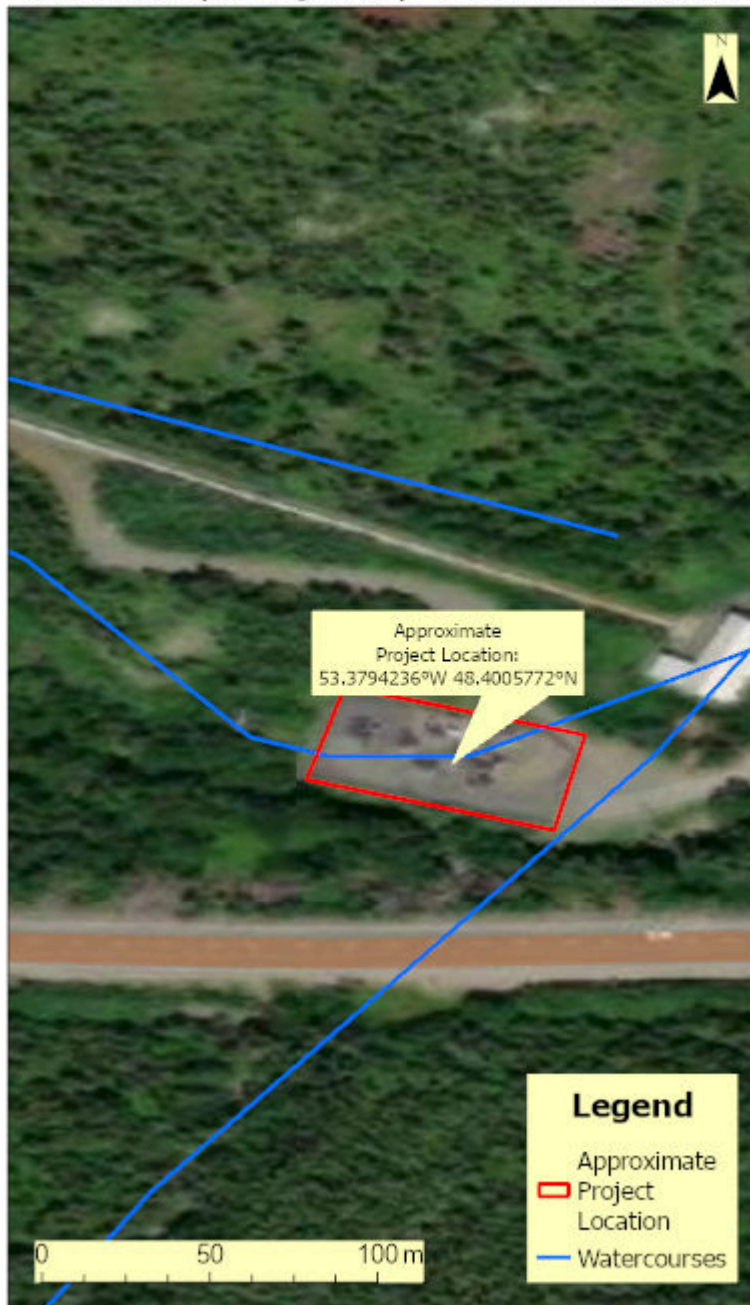
Port Rexton (Rattling Brook) - Substation Demolition