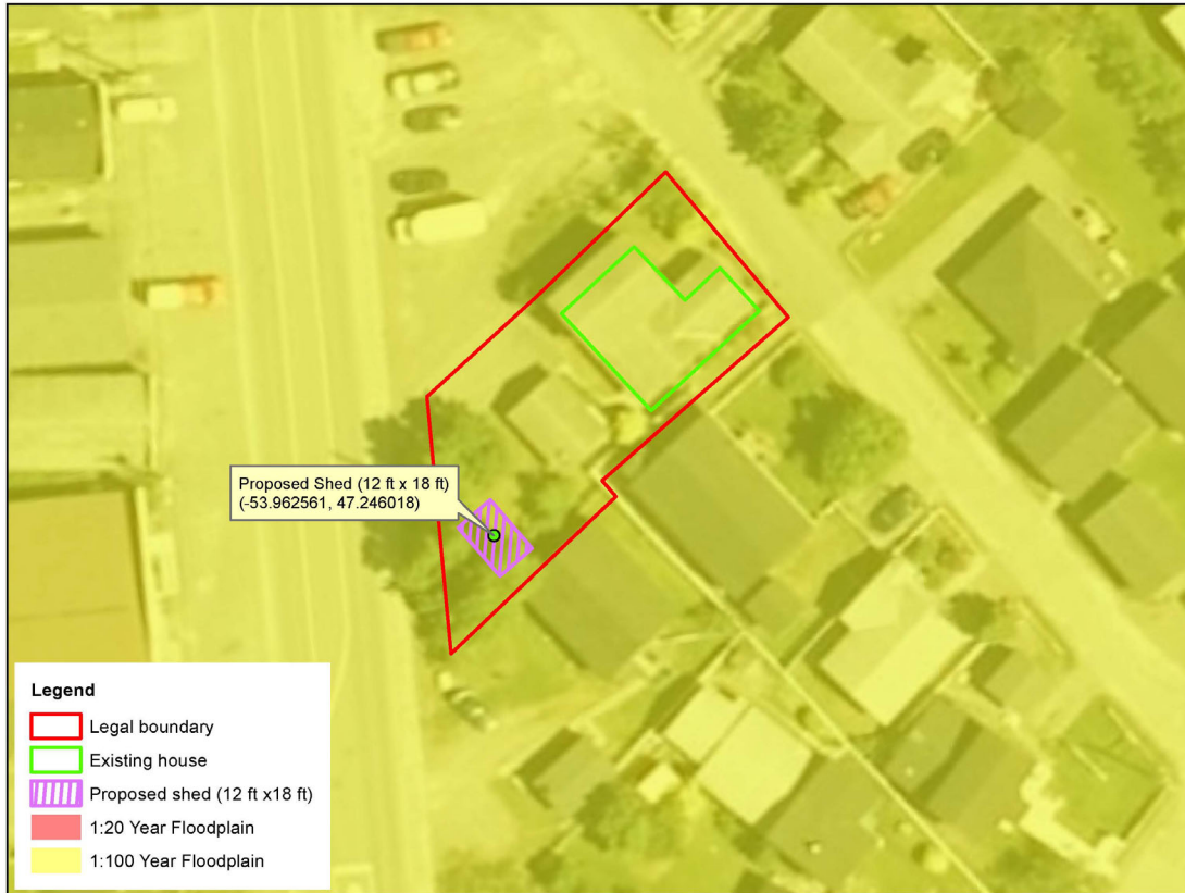
Shed Construction at 6 Gilwell Street, Placentia