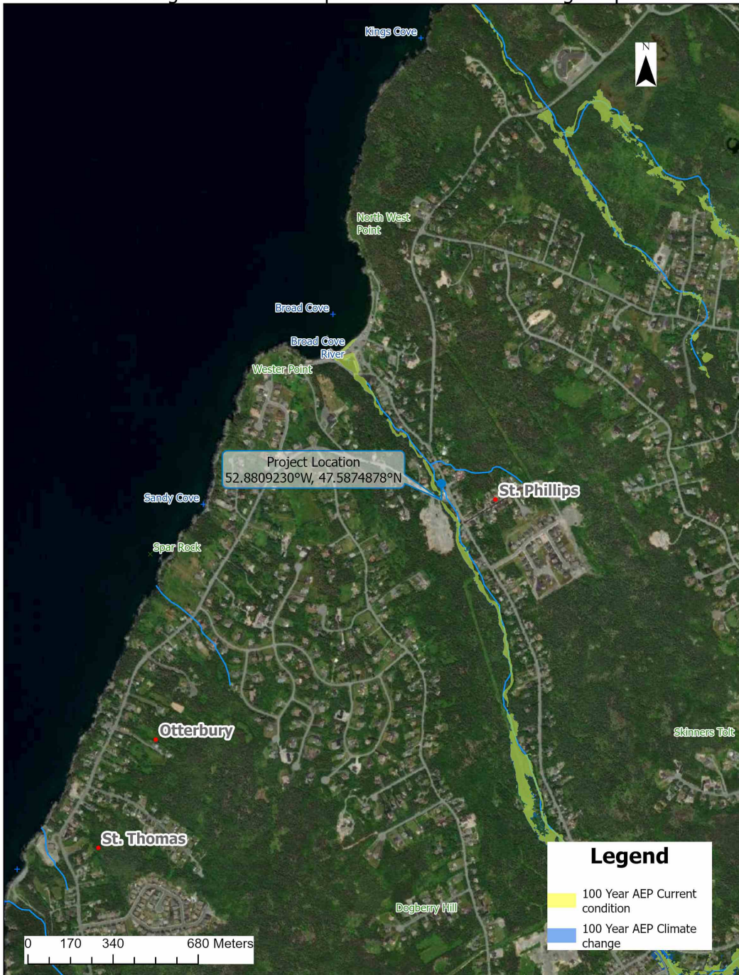
Town of Portugal Cove-St. Phillips - Broad Cove River Bridge Replacement