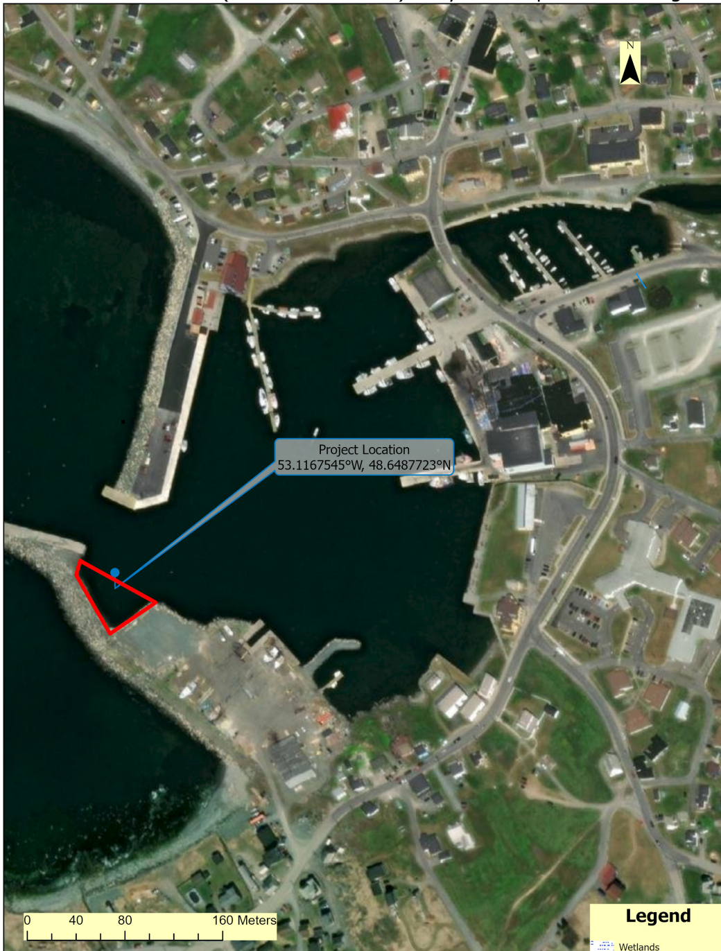
Town of Bonavista (Bonavista Harbour) - Laydown Expansion Infilling