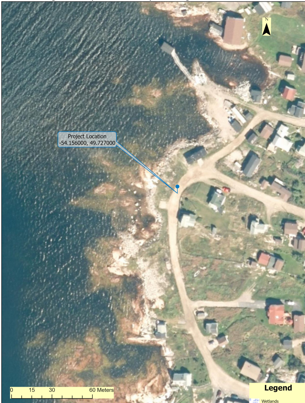
Town of Fogo Island (Joe Batt's Arm) - Infilling and Boathouse Construction