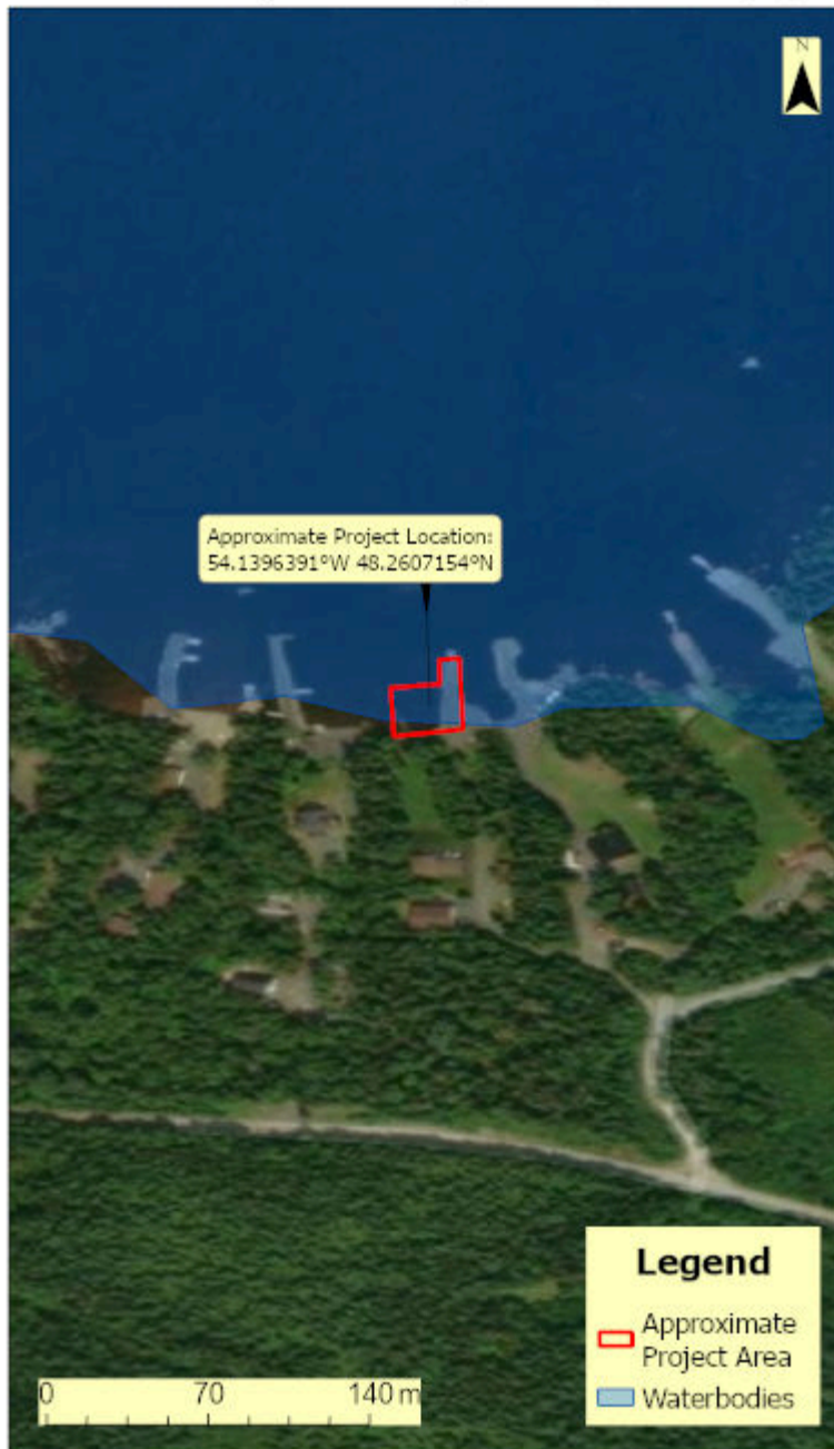
Port Blandford (Thorburn Lake) - Infilling and Dredging