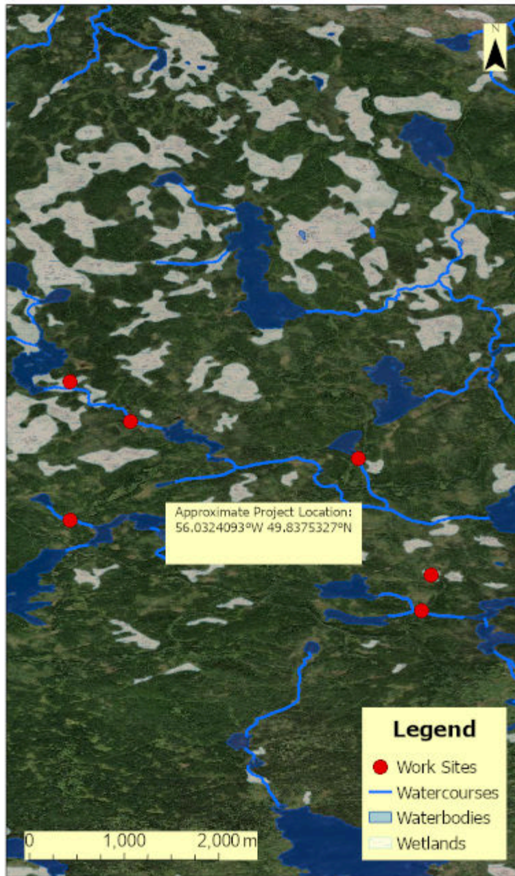
Baie Verte (Multiple Waterbodies) - Geotechnical Investigation