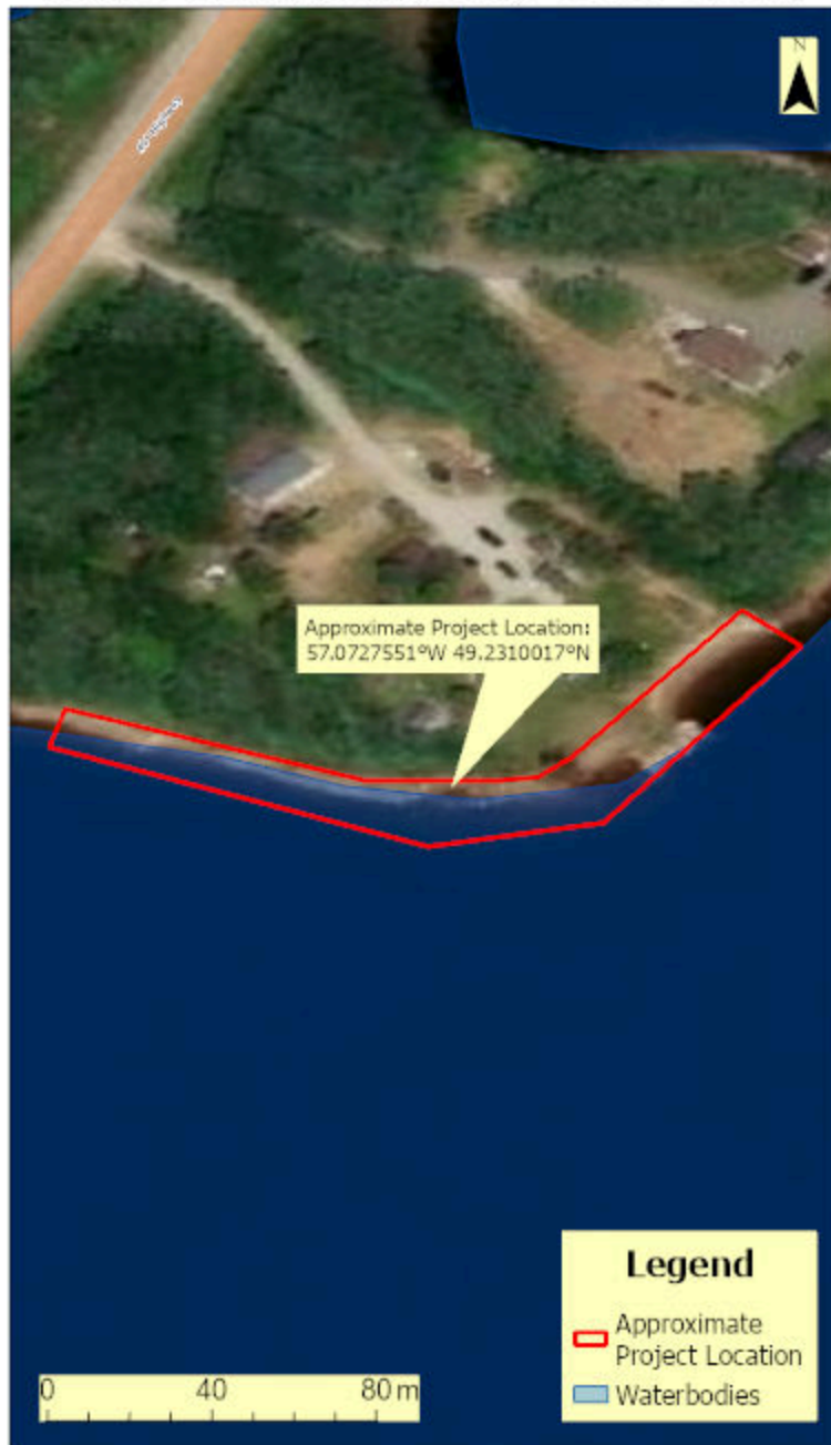
Town of Howley (Sandy Lake) - Beach Cleanup