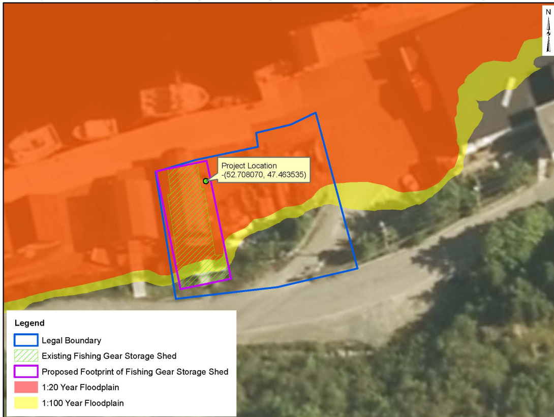
Expansion of an existing Fishing Gear Storage Shed at 29-31 Southside Road, Petty Harbour