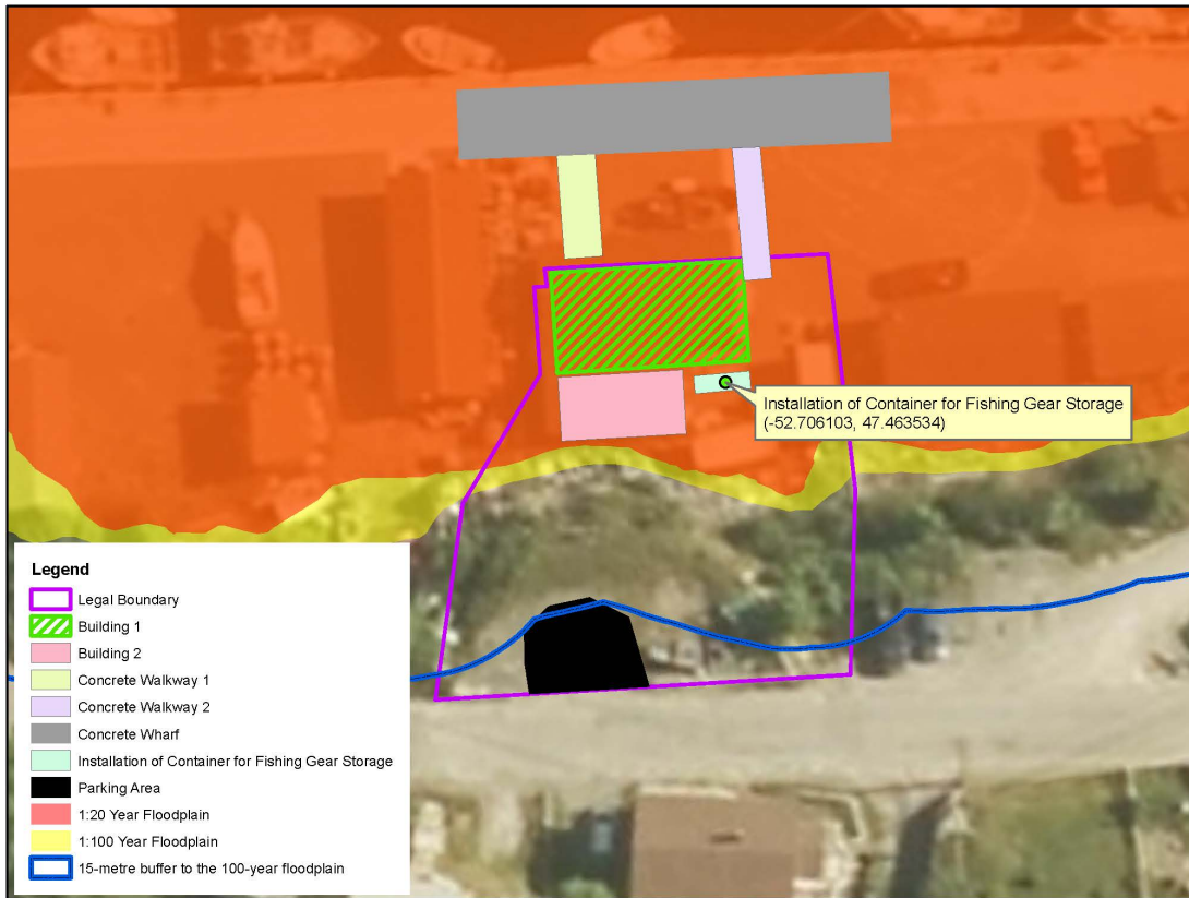
Installation of a Container at 51-53 Southside Road, Petty Harbour for Fishing Gear Storage