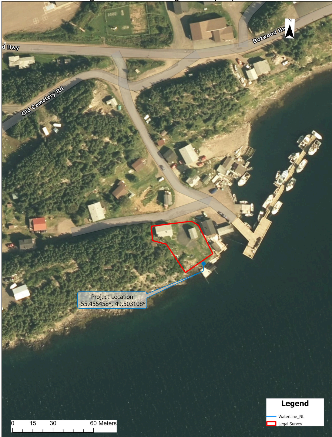
Town of Leading Tickles - Wharf Stage and Slipway Revitalization