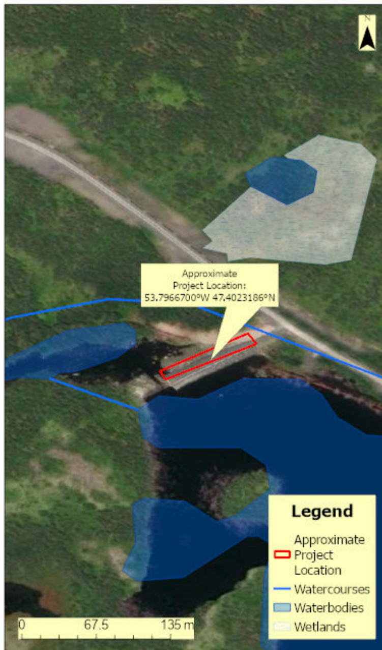
Long Harbour - Mount Arlington (Rattling Brook Big Pond) - Boulder Removal