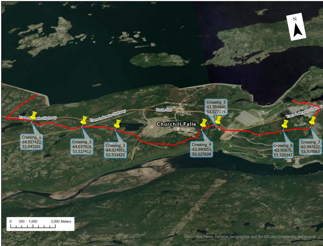
Churchill Falls - Various Unnamed Waterbodies - Firebreak Culvert Upgrades