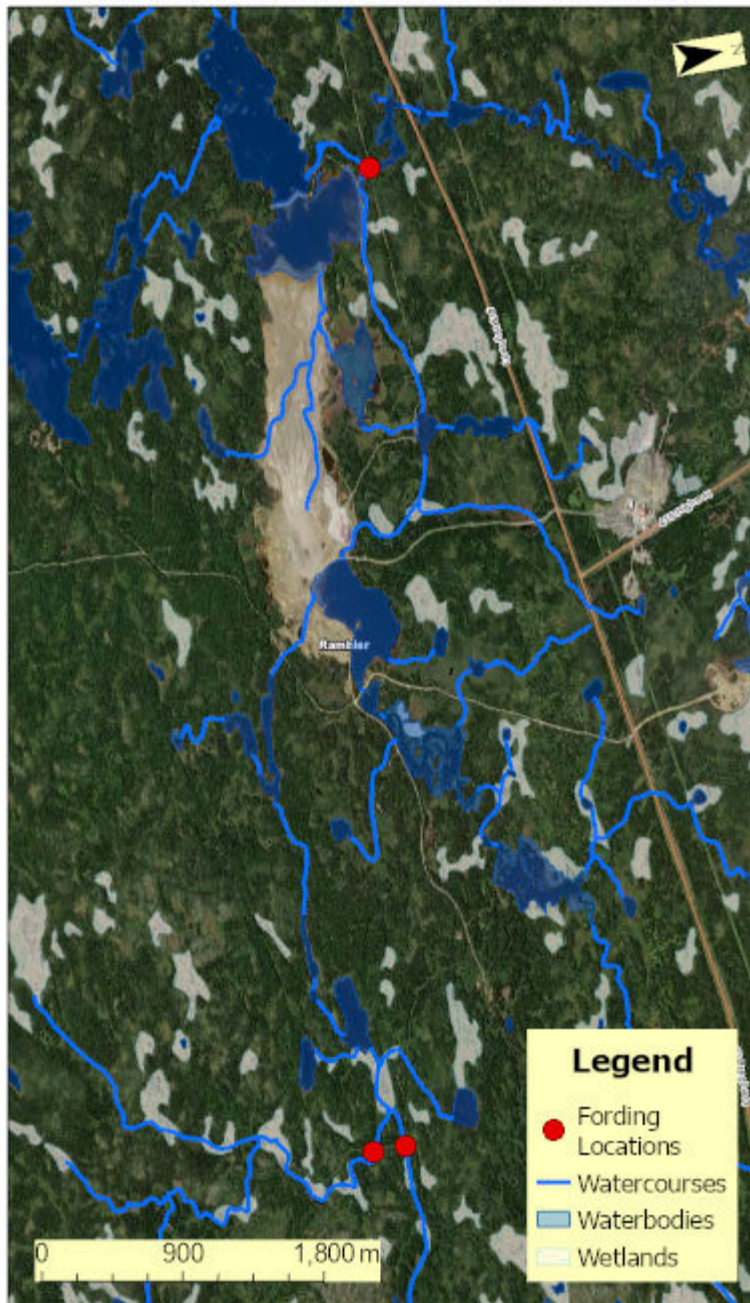
Baie Verte (Multiple Waterbodies) - Fording Locations