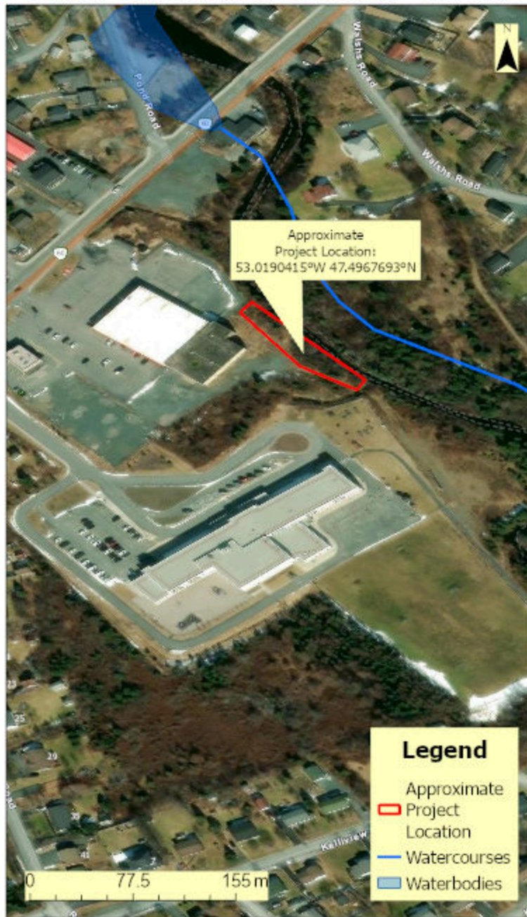
Town of Holyrood (Kelligrews River) - Grubbing