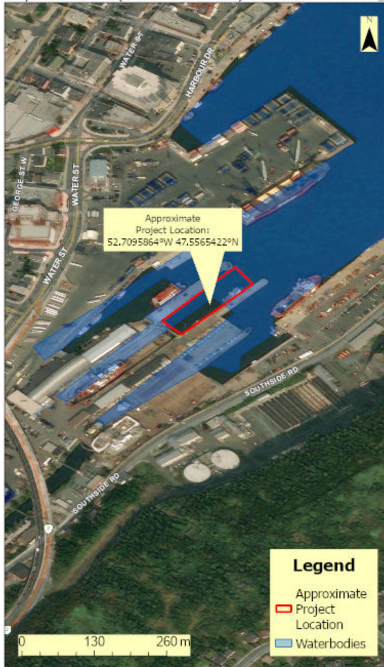
City of St. John's (St. John's Harbour) - Geotechnical Drilling