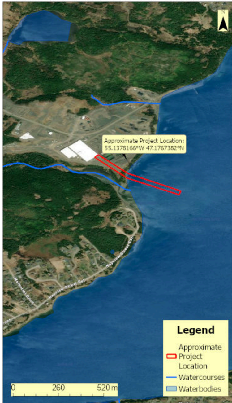
Town of Marystown (Mortier Bay) - Effluent Outfall