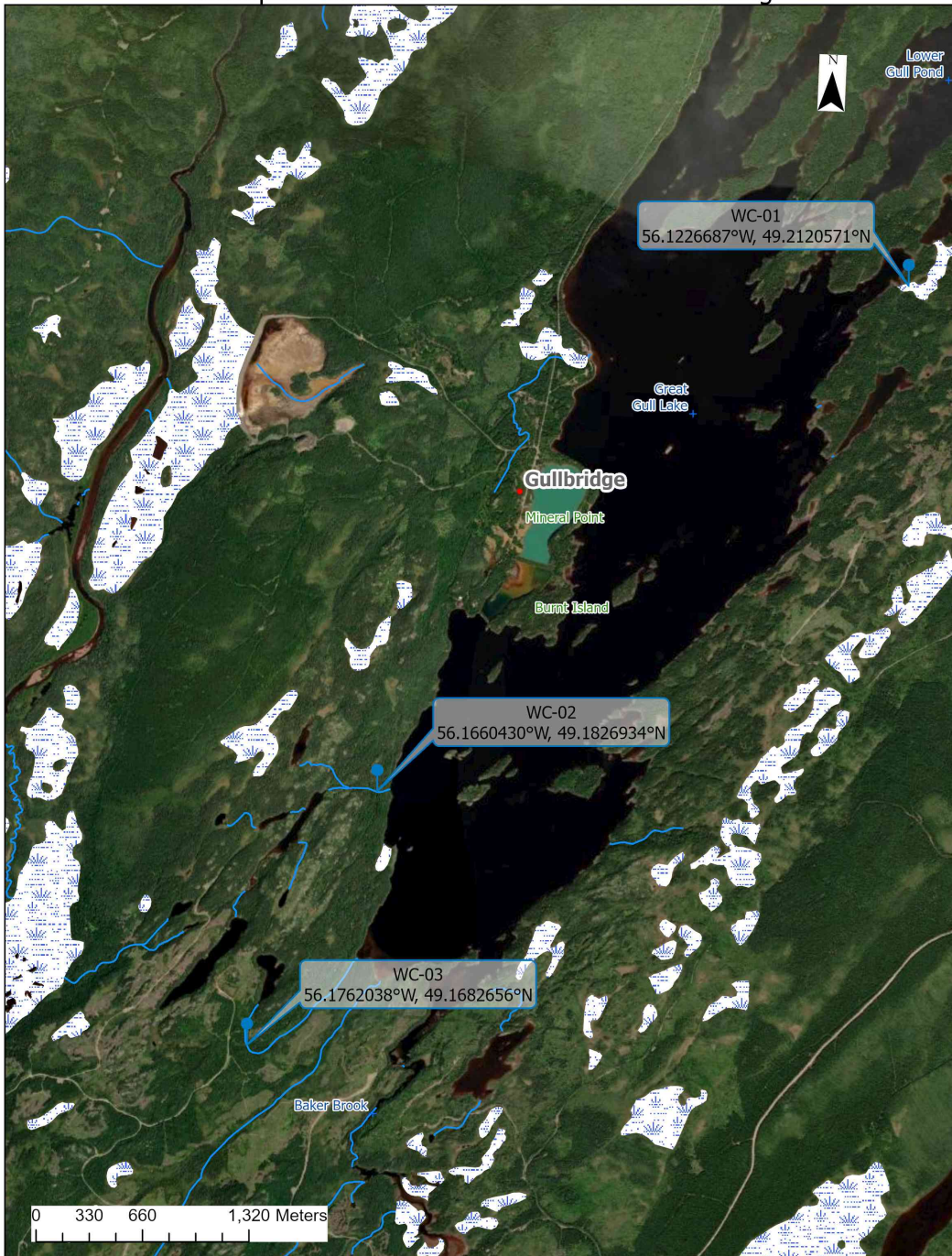
Champion Iron Mines Limited - E250422 - Fording