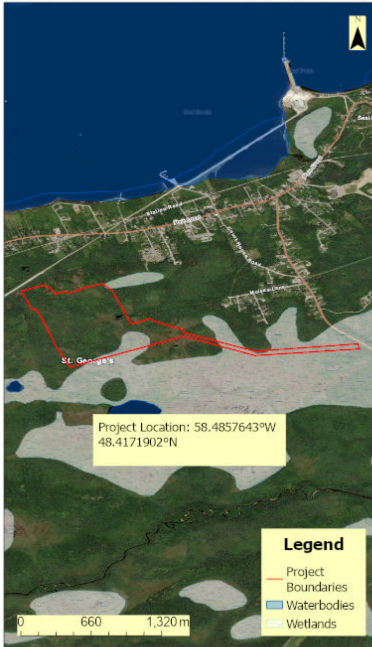
Town of St. George's (Unnamed Wetlands) - Land Clearing