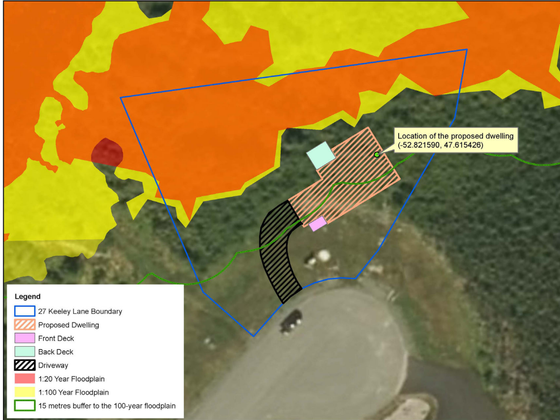
Dwelling Construction at 27 Keeley Lane, Portugal Cove-St. Philip's