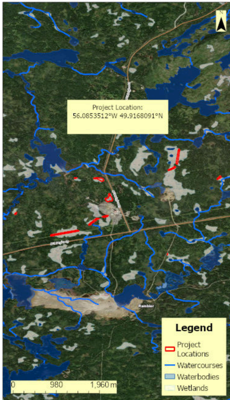
Baie Verte (Multiple Wetlands) - Road Network