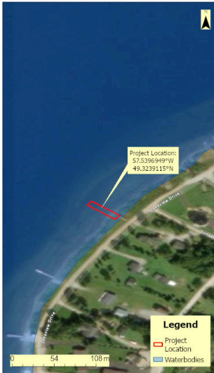
Bonne Bay Pond (Bonne Bay Big Pond) - Dock Construction