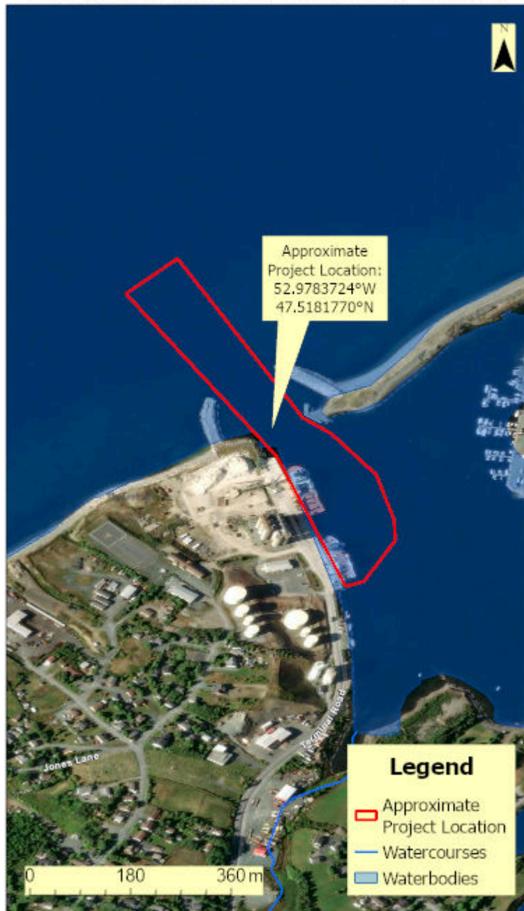
Conception Bay South (Long Pond Harbour) - Dredging