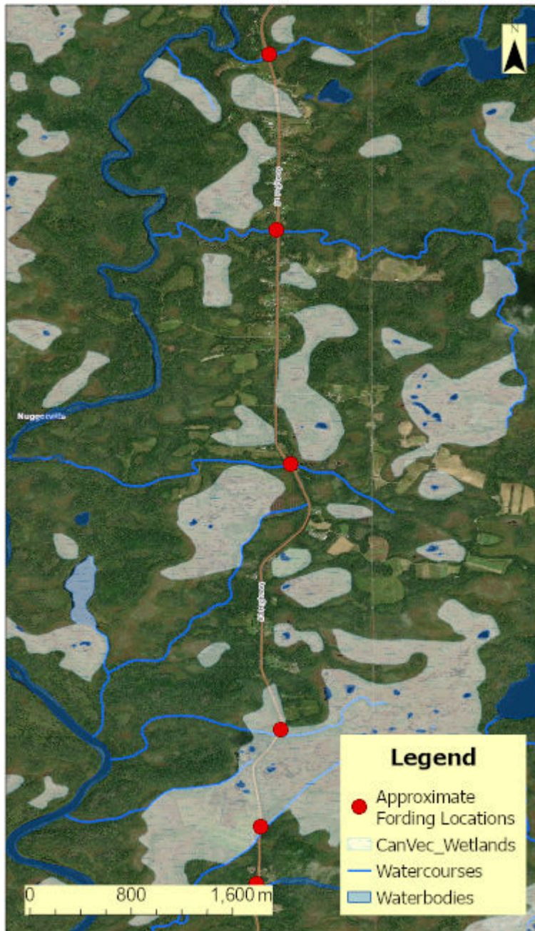
Transmission Line 94L (Multiple Waterbodies) - Fording