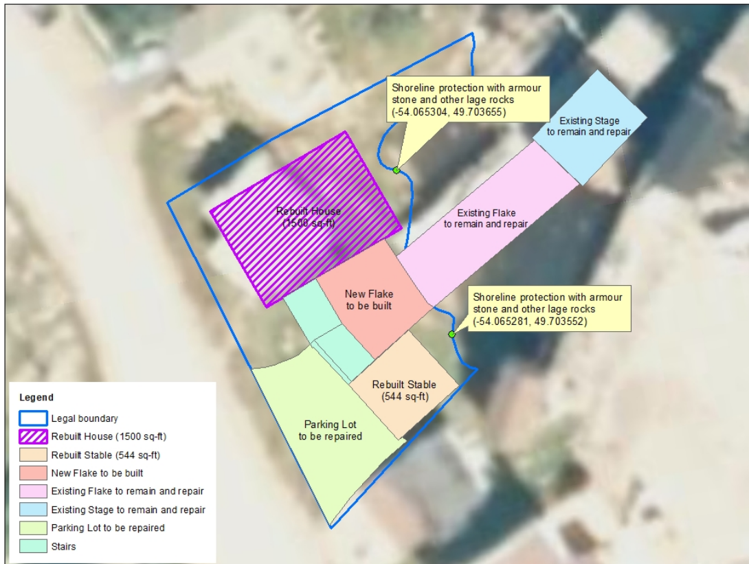
Reconstruction of House and Stable, and Protection of Shoreline at 73 Main Street, Tilting, Fogo Island