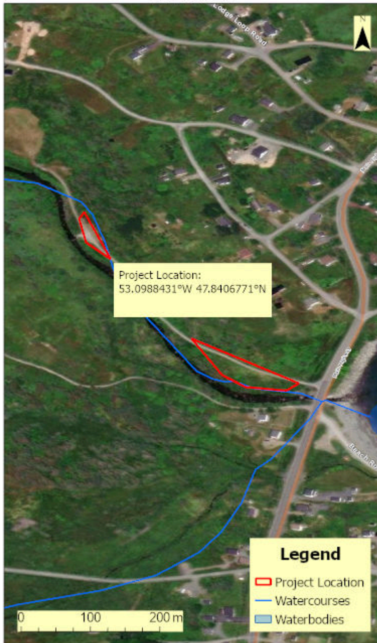
Small Point - Adam's Cove (Broad Cove Brook) - Fire Remediation