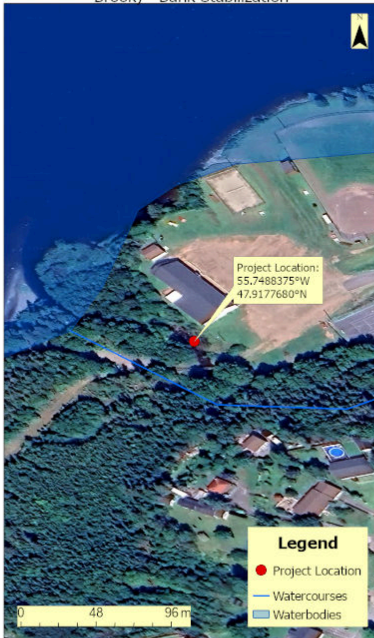
Town of Milltown - Head of Bay D'Espoir (Jersey Brook) - Bank Stabilization