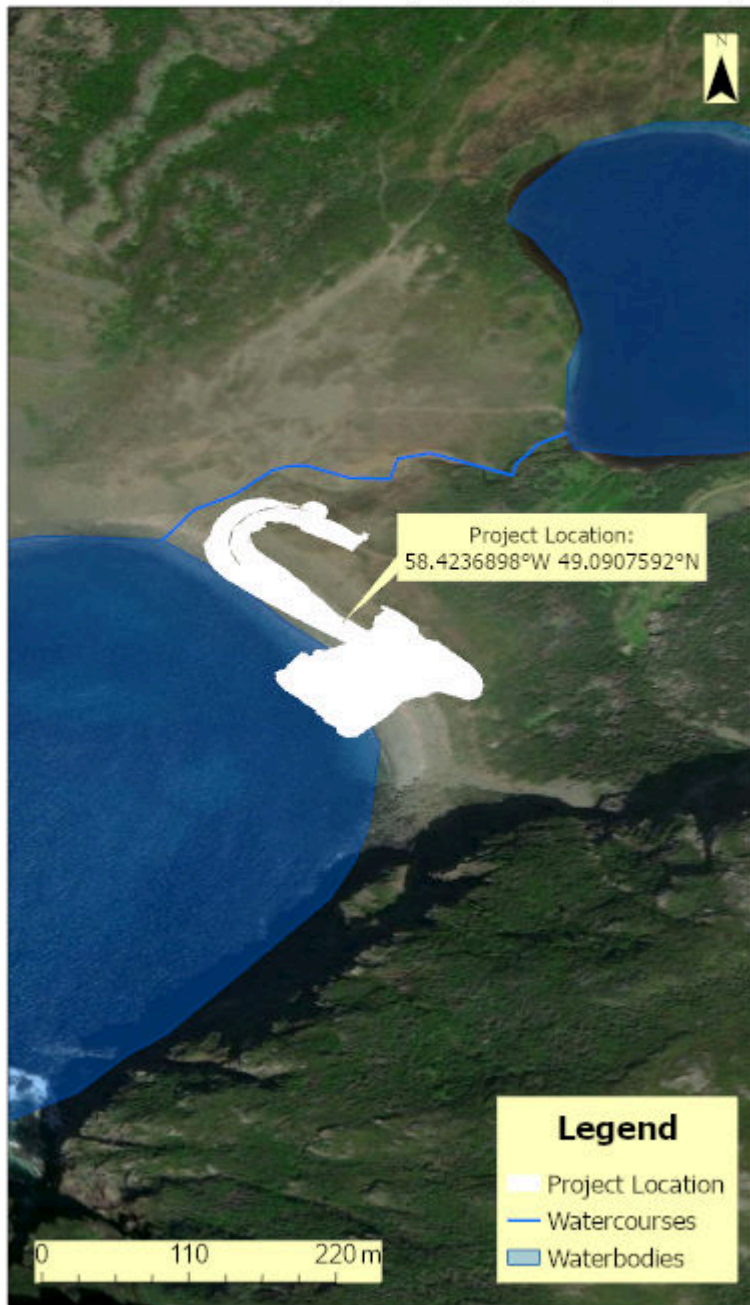
Town of Lark Harbour (Wild (Capelin) Cove) - Infilling