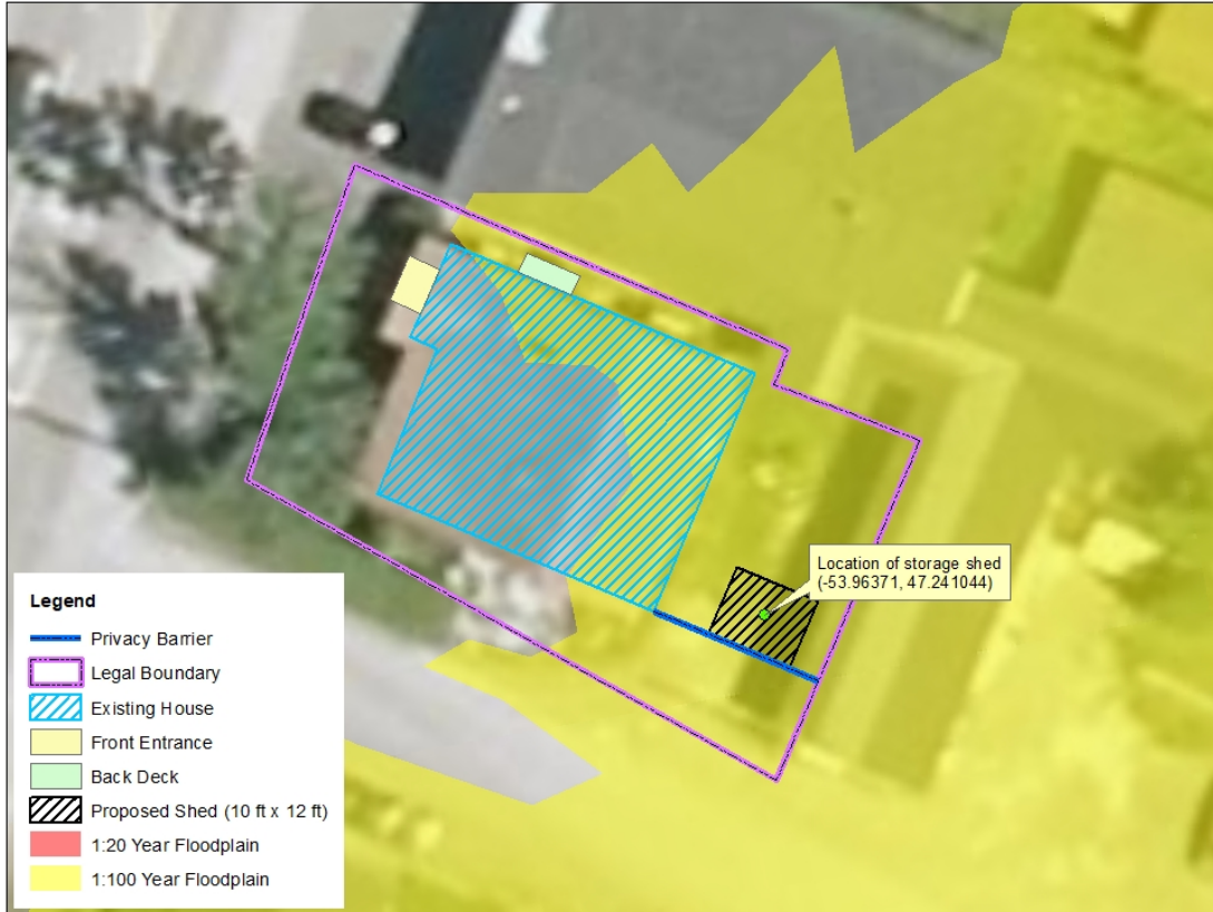
Storage Shed Construction at 11 Blockhouse Road, Placentia