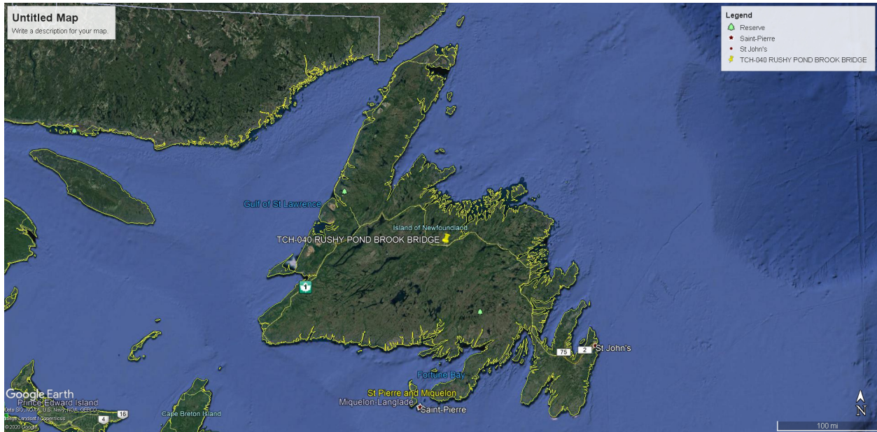
Map 1: Location on Island