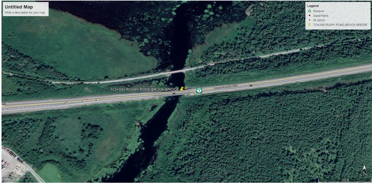
Map 3: Close-up of Bridge Site