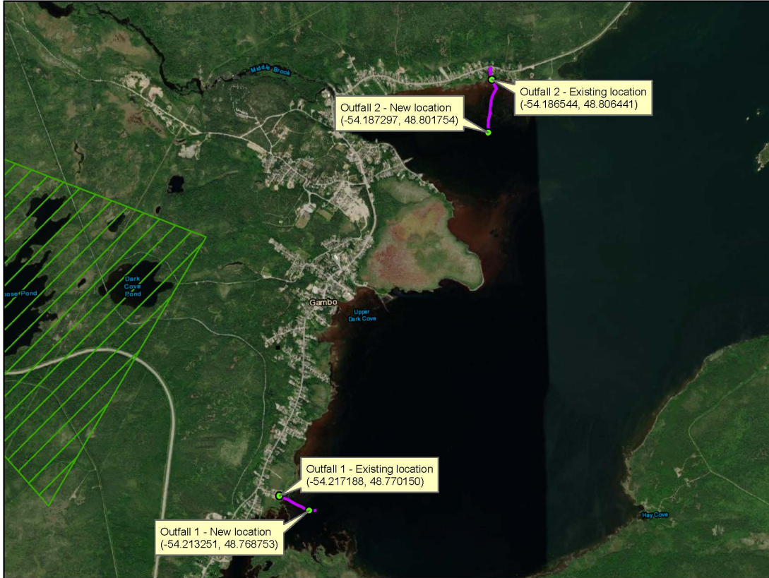
Town of Gambo - Sewer outfalls relocation