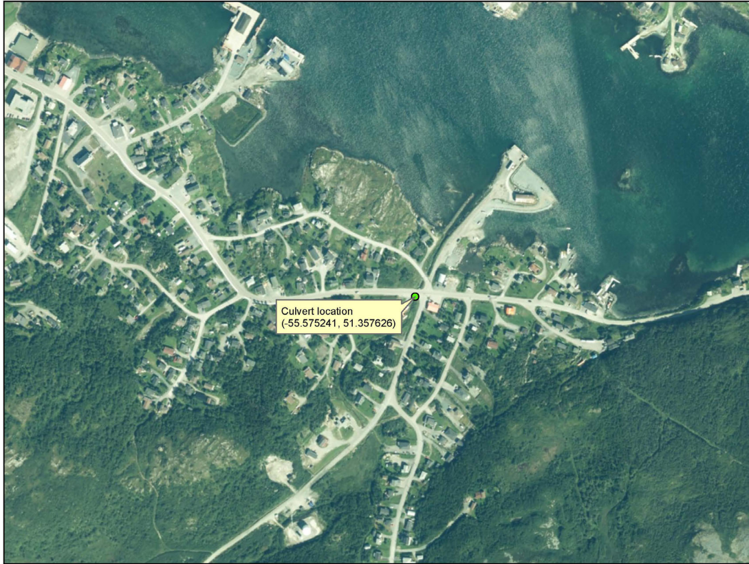
Town of St. Anthony (Unnamed Waterbody) - Culvert