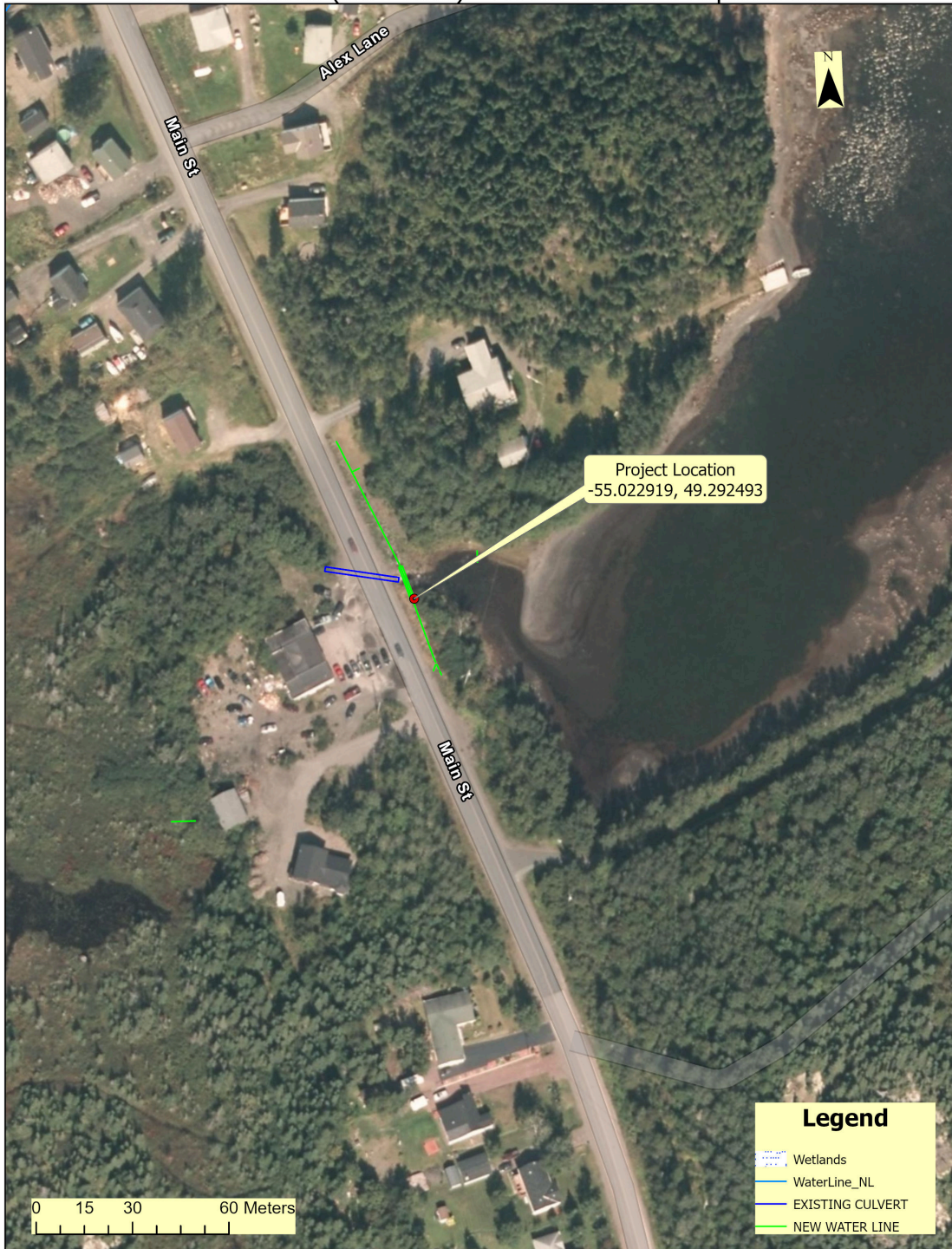
Town of Embree (Jobs Cove) - Partial Waterline Replacement