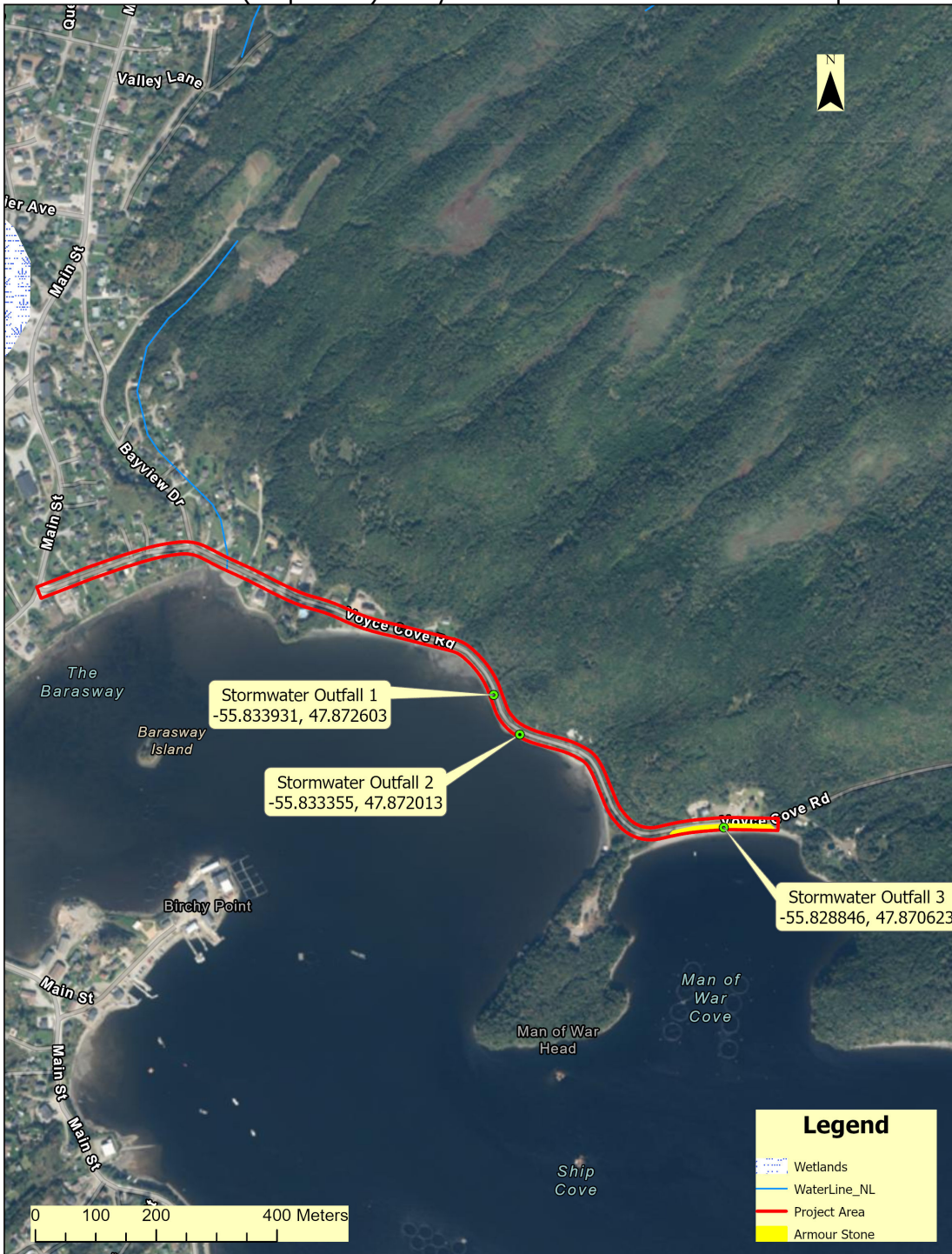
Town of St. Alban's (Ship Cove) - Voyce Cove Road Water Services Replacement