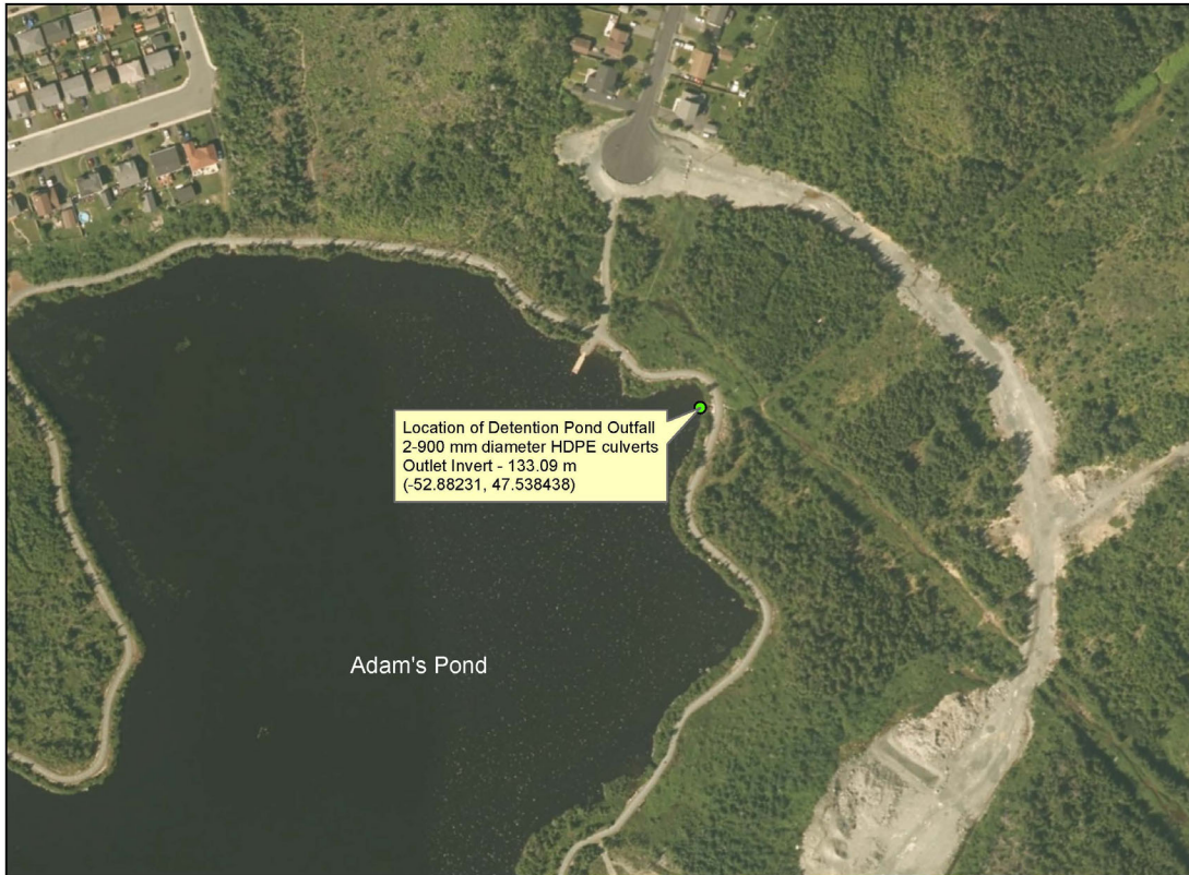
Installation of Stormwater Outfall at Adam's Pond Lakeside Phase 7 Residential Subdivision, Paradise