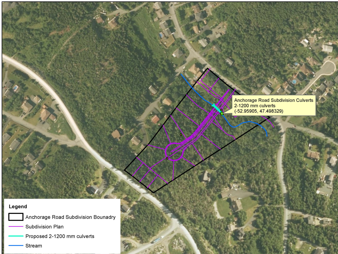
Anchorage Road Subdivision Culvert Installation in Conception Bay South