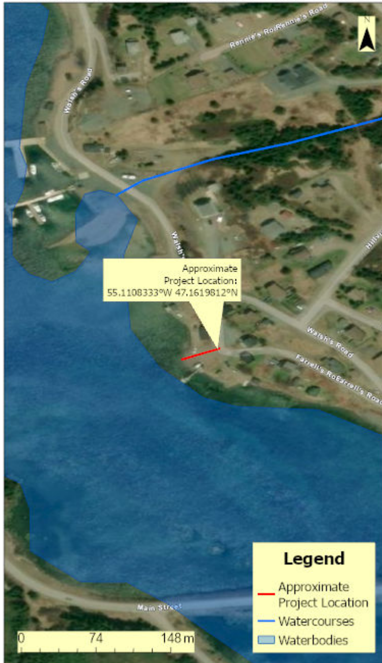
Marystown (Placentia Bay) - Water and Sewer Upgrades