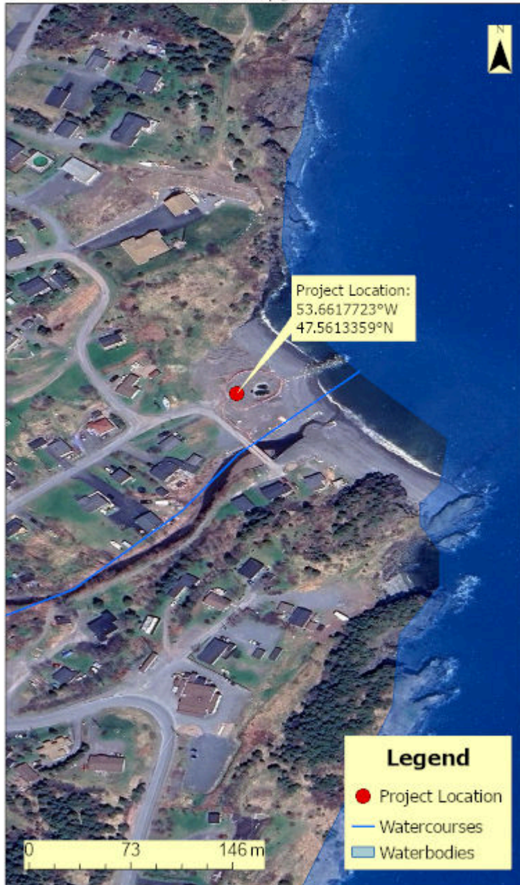
Norman Cove - Long Pond (Norman's Cove) - Sanitary Sewer Upgrades