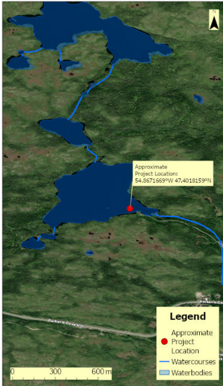
Town of Parker's Cove (Big Pond) - New Water Intake