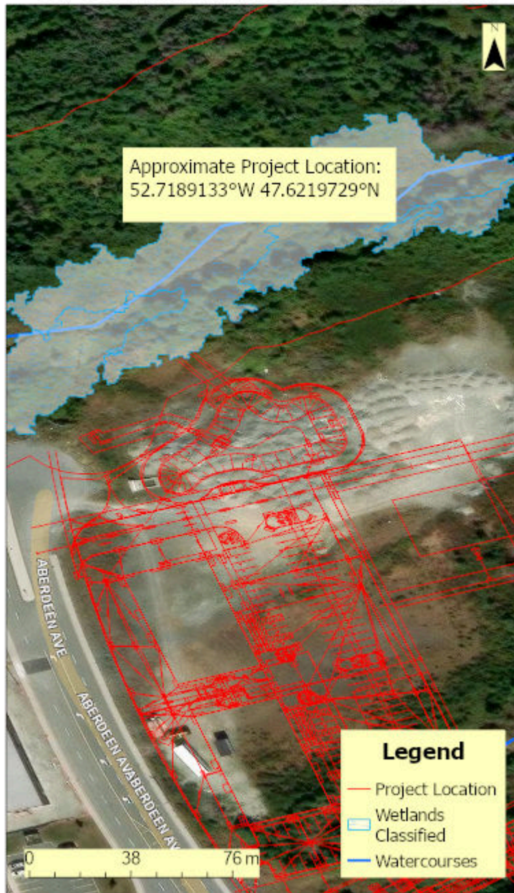
City of St. John's (Outer Cove Brook) - Outfall